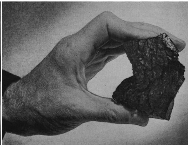
Terence Gower, Wilderness Utopia , 2008