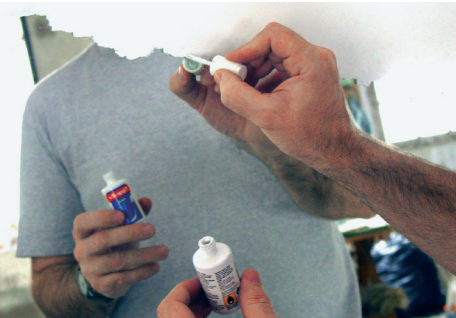
“涂改” Correction , 2001