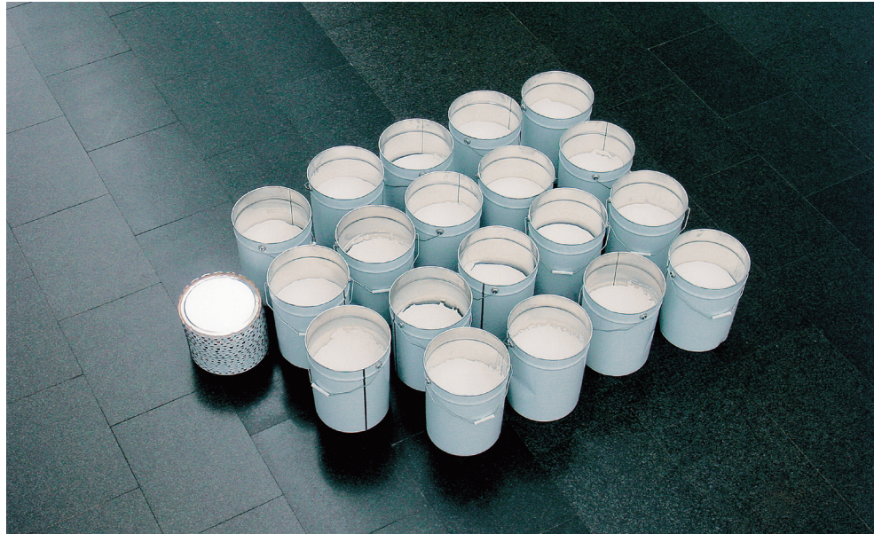
“浪费” Waste , 2001